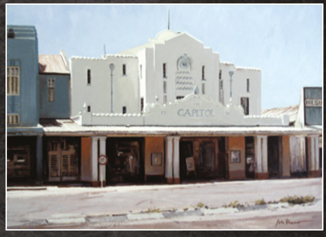
The art-deco Capitol Cinema still stands on Livingstone's main street